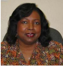
Greetings from the President,